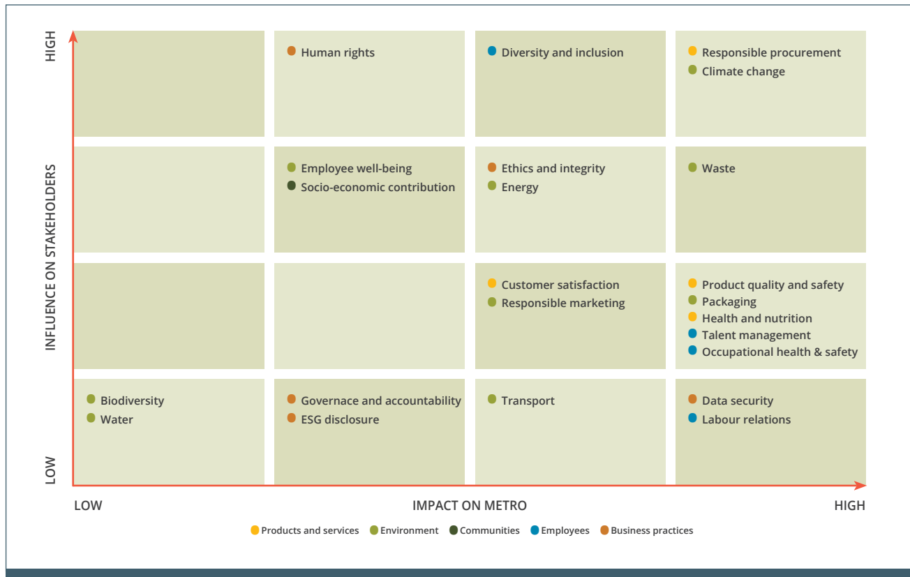
Figure 2: Metro's materiality matrix from the 2022 corporate responsibility report.

Metro's 2022 Corporate Responsibility report also contains a materiality matrix which "identified, prioritized and validated the environmental, social and governance (ESG) topics that are most important to our key stakeholders and business..." . This is shown in Figure 2, which shows biodiversity and water issues having the least influence on stakeholders, and the lowest impact on Metro.<sup>1</sup>