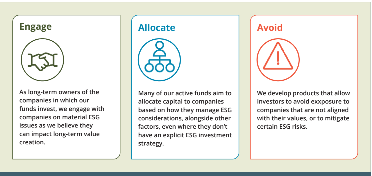
Figure 3: Vanguard's approach to ESG investing. Source: Vanguard.viii

Figure 3 shows Vanguard's approach to ESG investing. One of the pillars it relies on is its engagement with companies on material ESG issues. This places responsibility on the Vanguard's engagement teams as they will need to assess whether management's efforts are strong enough to warrant voting against biodiversity proposals. Table 6 offers evidence that suggests the management teams are effective in convincing Vanguard of their management of deforestation and other biodiversity-related issues, as in the vast majority of cases they failed to support anti deforestation and genetic material proposals.